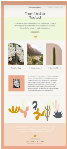
(I like how each section has a different method of organization, some are image based and some rely on text more)